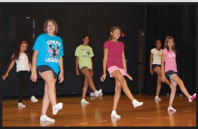
Energy Exploration Summer Program - Page 5