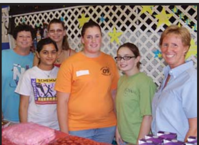
Vo-Tech at the Salem County Fair Page 7