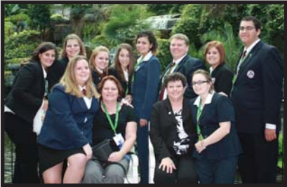
Students Win National Recognition Page 4